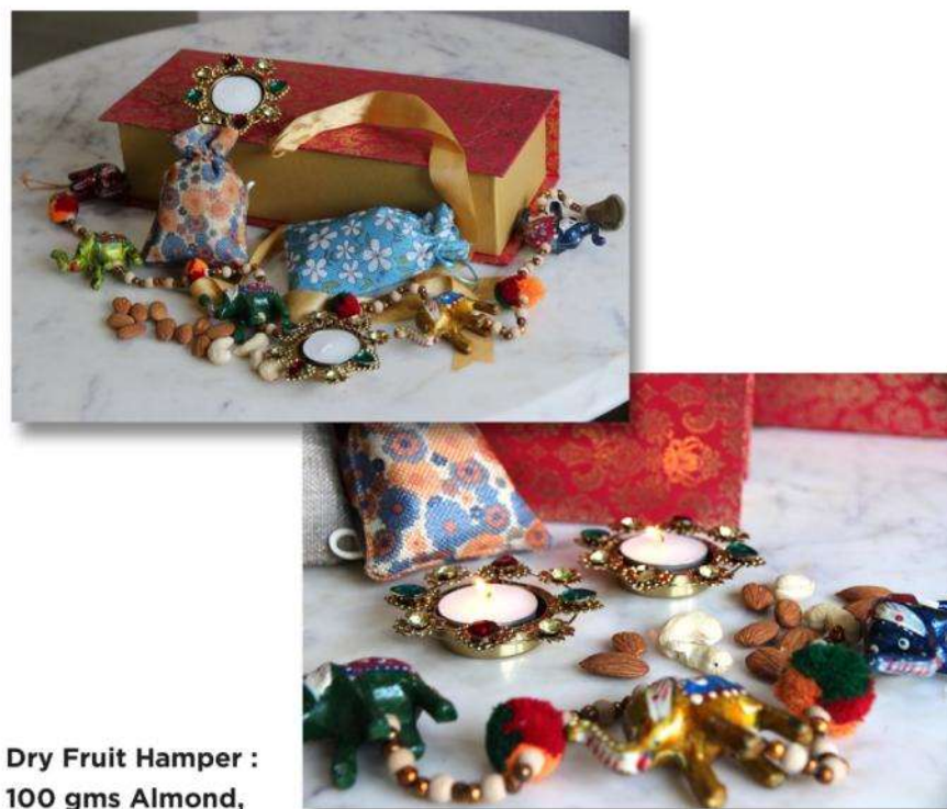
Dry Fruit Hamper : 100 gms Almond, 100 gms Raisins, 1 Festive T-light set, 1 toran in a gift box packaging

Product and packaging images are representative. Actual piece may vary depending on availability – but of same value