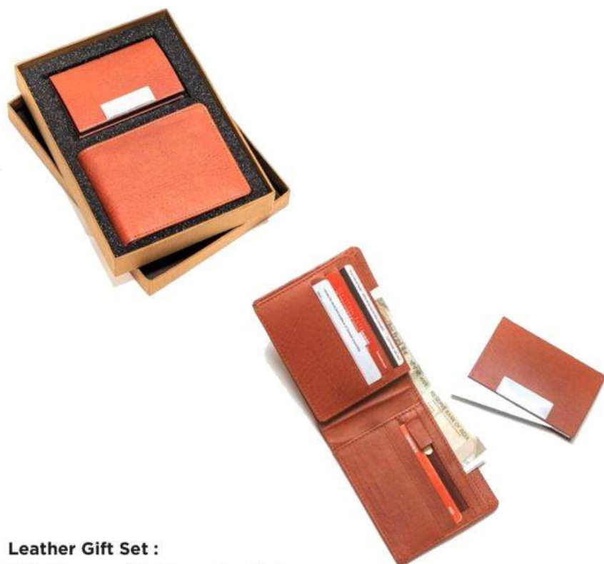
Leather Gift Set : 1 Visiting card holder + 1 wallet with personalised name in gift Box packing